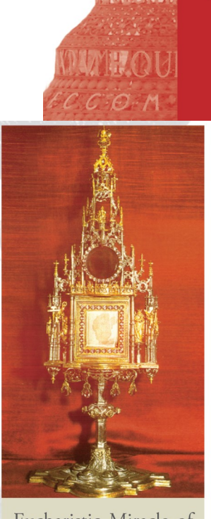
Eucharistic Miracle of Bois-Seigneur-Isaac , Belgium (1405). Relic of the bloodstained Corporal.

arlo's exhibition presents a selection of the main Eucharistic Miracles (about 136, collected in 166 panels 60x80, plasticised) which occurred over the centuries in various countries and are recognised by the Church. Through these panels you can "virtually visit" the places where the miracles happened.