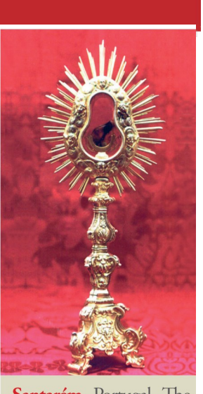
Santarém, Portugal. The Monstrance contains a relic of the Eucharistic miracle which happened in 1247. Here too, the Host turned into Flesh.